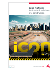
Leica iCON site Brochure