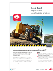
Leica ConX Flyer