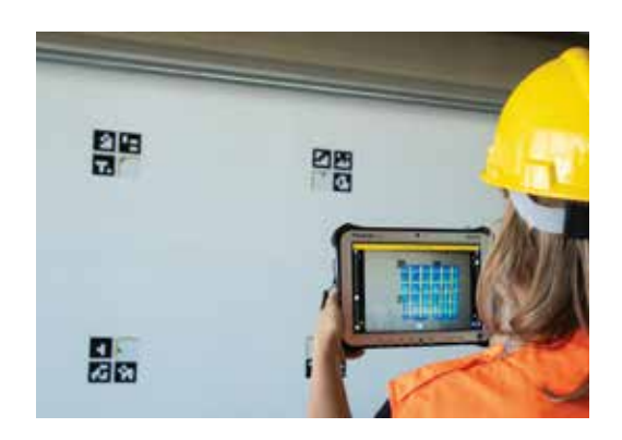
Augmented Reality for real time data visualisation with more accuracy