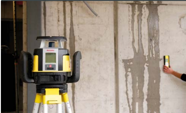
HORIZONTAL ONE-BUTTON LASER