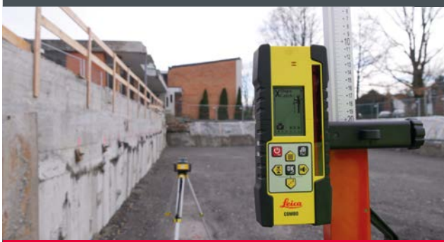
HORIZONTAL & SLOPE LASER