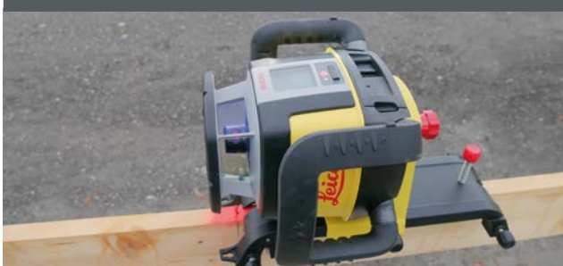
HORIZONTAL, VERTICAL & MANUAL SLOPE