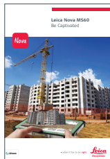
Leica Nova MS60

Illustrations, descriptions and technical data are not binding. All rights reserved. Printed in Switzerland – Copyright Leica Geosystems AG, Heerbrugg, Switzerland, 2015. 836338en – 05.15 – INT