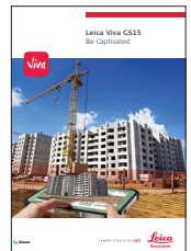
Leica Viva GS15