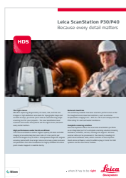
Leica ScanStation P30/40

Illustrations, descriptions and technical specifications are not binding. All rights reserved. Printed in Switzerland – Copyright Leica Geosystems AG, Heerbrugg, Switzerland 2016. 835466en - 03.17