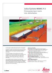
Leica Cyclone MODEL

Leica Geosystems AG leica-geosystems.com