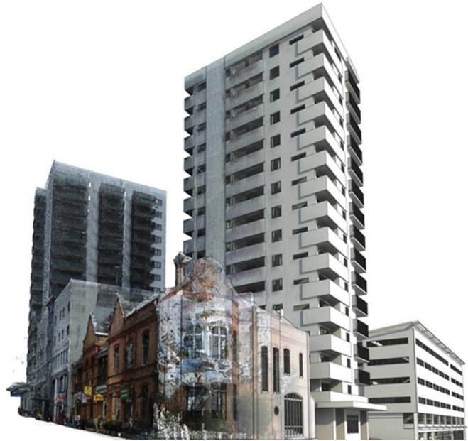
3D Model from point cloud

In most cases, new facilities are designed by architects in packages such as REVIT or ArchiCAD. Where there is an interface to an existing building, it is common for the existing building to be 'modelled' and the new building designed around it. A survey-accurate model of the existing building is required, especially in the case of complex facades or critical tie-in details, and this is an opportunity for a surveyor to get involved. Traditionally delivered as 2d CAD elevations, we now see laser scanners often used to capture the data, providing a highly visual, complete, 3-dimensional dataset that can be used as the basis of multiple deliverables. More specialised skills are required to develop the model, for which a surveyor may have in-house expertise or outsource to a specialist modelling house. Regardless of who develops the model, quality verification of the spatial information should still sit firmly with the surveyor.