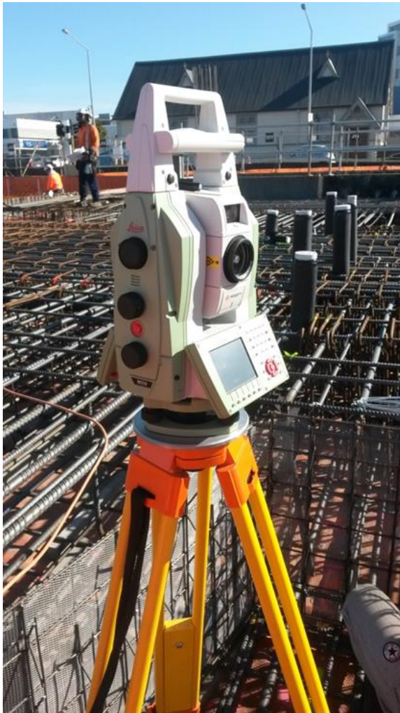
Construction layout and scanner

It is essential that we embrace the need to work solely with 3D data in order to get involved with BIM. Often, we capture or design in 3D only to represent it in 2D to our client. The leap from 2D to 3D is