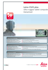
Leica CS25 plus