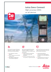
Leica Zero Connect