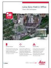
Leica Zero Field & Office