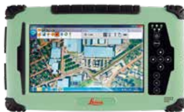
CS25 - ALL VARIANTS