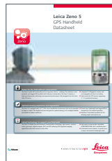
Leica Zero 5

Microsoft, Windows® and the Windows logo are either registered trademarks or trademarks of Microsoft Corporation in the United States and / or other countries.